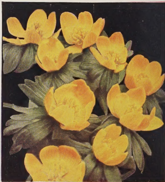
ERANTHIS HYEMALIS (Winter Aconite)

ERANTHIS HYEMALIS (Winter Aconite). Quaint yellow flowers of good size which are surrounded by a ruff of green. They pop into bloom through February at the slightest hint of warmth. Use among other bulbs for early color. 12 for 50c, 100 for $3.75